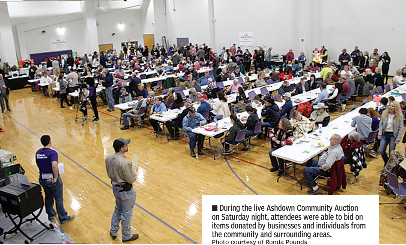
During the live Ashdown Community Auction on Saturday night, attendees were able to bid on items donated by businesses and individuals from the community and surrounding areas.