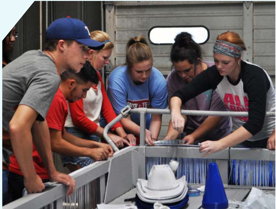
Honors College students decorate the Texarkana College float for the Four States Fair Parade. The Honors College isn't just an academic endeavor—students are required to commit personal time outside of class to helping with college and community events.

The new TC Presidential Scholarship is completely funded by private donors through the TC Foundation.